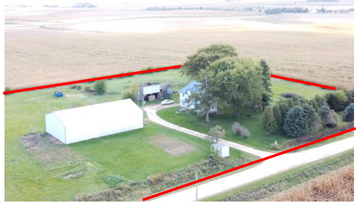
View From Northeast