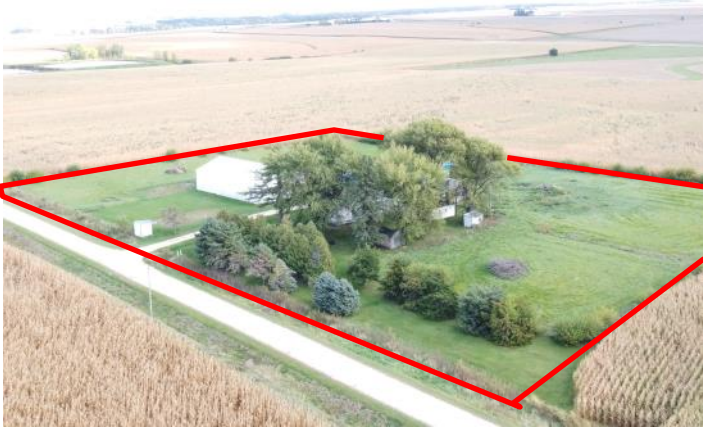
View from the Northwest