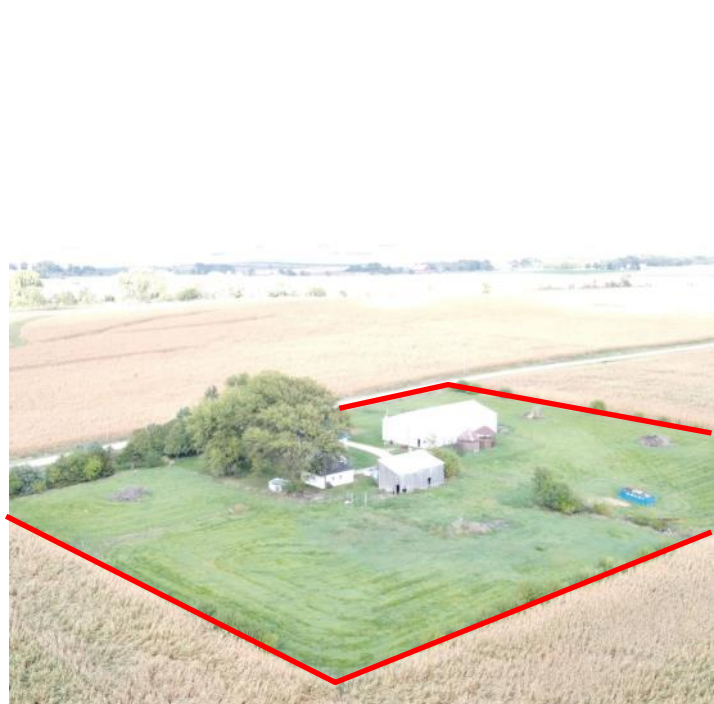
View from the Southeast