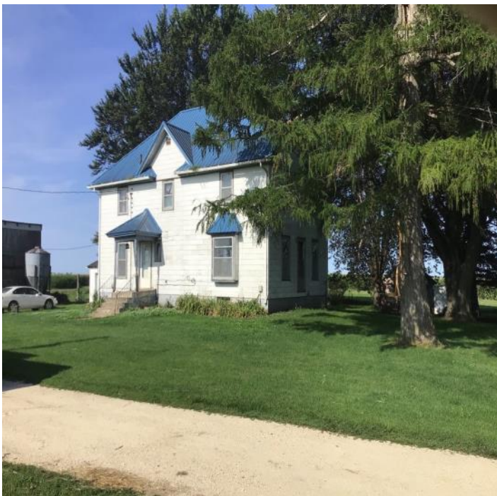
4 Bedroom House